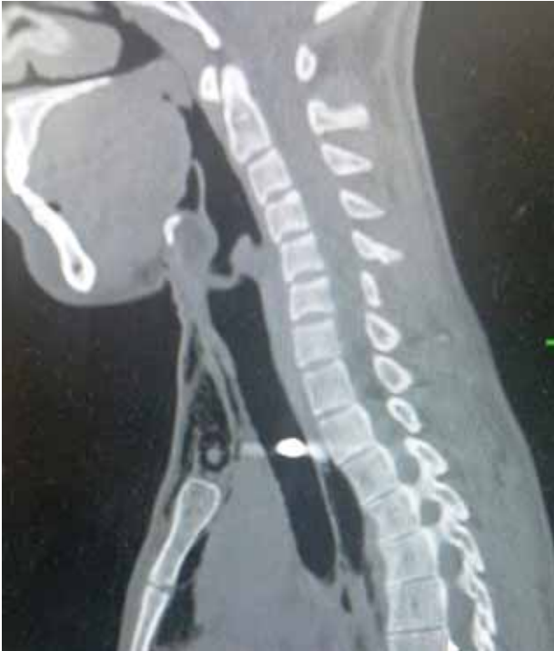
Computed tomographic scan of the neck showing bullet in the lateral wall of the trachea.

The patient was found to have bullet in the right chest, which he spontaneously expectorated after more than 4 months [3]. Andrews and colleagues described a case in which the bullet was found on chest radiograph to be adjacent to the right main bronchus. On the way to the operating room for bronchoscopy, the patient coughed and expectorated the bullet [4]. A similar case was published by Rhodes and Gupta [2] in which the patient had expectorated the bullet while the patient was being taken for bronchoscopy. Hesami and Johari [5] reported a case of a bullet lodged near the tracheal bifurcation. This patient, although stable at presentation, did have a hemopneumothorax and tube thoracostomy was performed. The patient recovered well and was discharged home with the bullet still in place. Three months after the injury, the patient experienced a bout of coughing and expectorated the bullet.