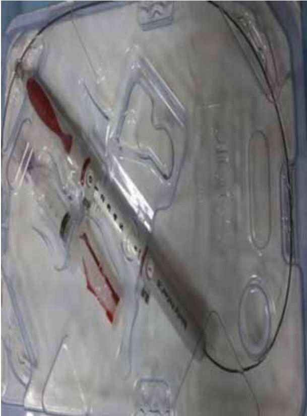
EchoTip ProCore HD ultrasound biopsy needle, 22 G.