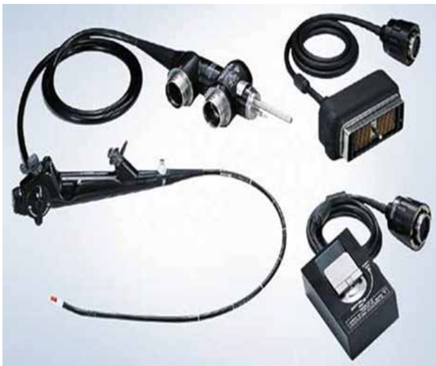
Endobronchial ultrasound convex probe BF-UC180F.