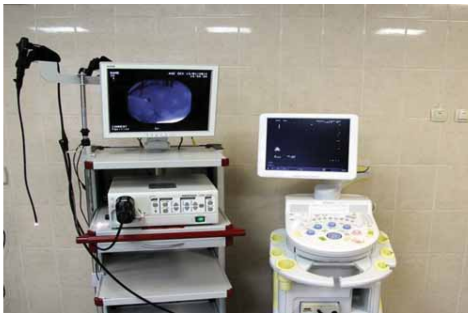
Endobronchial ultrasound convex probe BF-UC180F with ultrasound processor prosound α7 Premier.

examination (ROSE). Depending on the amount of collected material, the bronchoscopist assessed the adequacy for each sample, and if it was necessary, the EBUS-TBNA procedure was repeated from the same area until enough material was collected. Number of passes by the