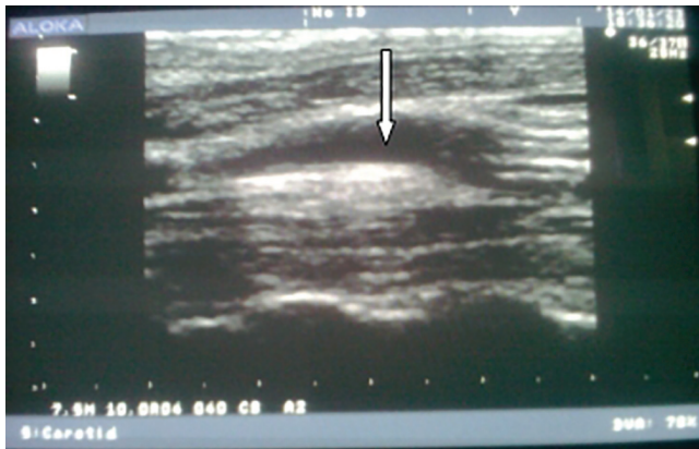
Gray-scale assessment of CIMT demonstrating the increased thickening of the wall with the presence of a carotid plaque (white arrow). CIMT, carotid intima-media thickness.