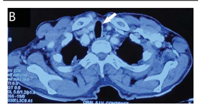
Contrast-enhanced computed tomography images showing scabbard trachea.

diameter of trachea at the same level, is markedly decreased in saber-sheath trachea. Tracheal index of less than two-thirds is said to have a specificity of 92.9% and sensitivity of 39.1% to diagnose severe obstructive lung disease. Elevated intrathoracic pressure coupled with repeated injury to cartilage inflicted by coughing leads to remodeling of the cartilaginous rings resulting in characteristic shape of the trachea [4]. No essential tracheal weakness is present in patients with COPD, as observed in Rayl [5] in his study on abnormal airway collapse during cough using cine-fluoroscopy. In a study conducted by