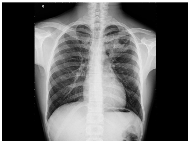
Chest radiograph at presentation.