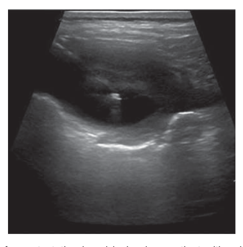
Biopsy of a metastatic pleural lesion in a patient with a history a squamous-cell carcinoma). The ultrasound image shows an expanding lesion on the pleural side.